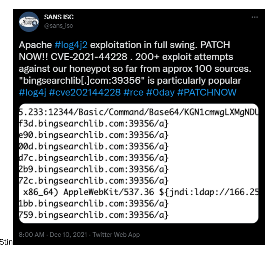
Figure 2 - SANS Internet Storm Center (ISC) detailing the scale of Log4j exploit attempts on December 10, 2021