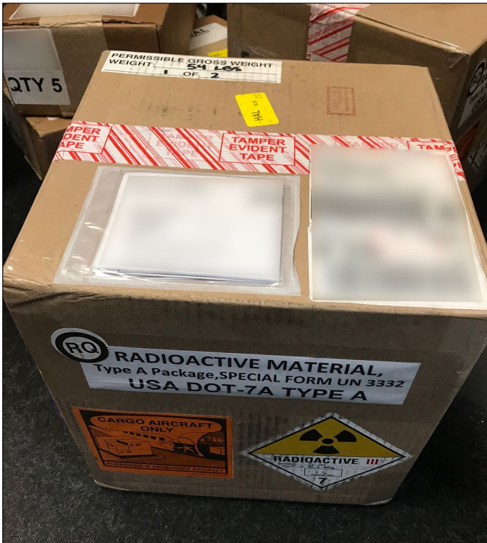
Figure 1: Photos of the High-Risk Radioactive Materials Purchased Using Fraudulent Licenses and Delivered to GAO's Shell Company (photos from November 2021 and March 2022)